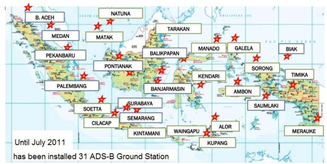
Figure 2: Indonesia ADS-B Ground Stations July 2011